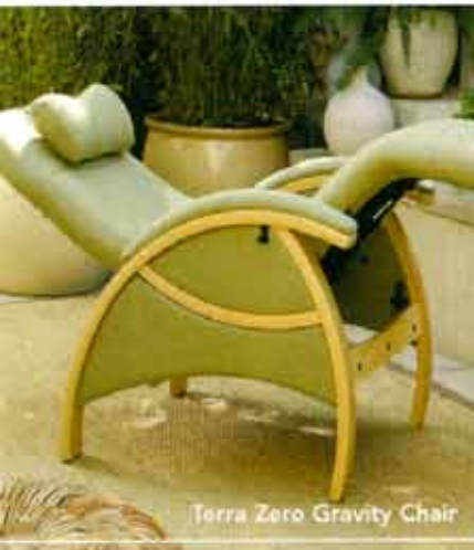
Terra Zero Gravity Chair

EGM Green: Exclusive manufacturer of home casino and entertainment tables—100% green certified products include a variety of gaming tables and seating. Environmentally conscious luxury lounge furniture also available. egmgreen.com