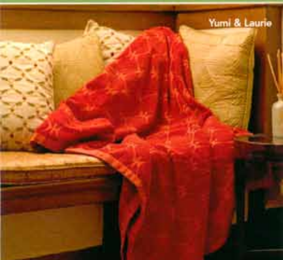
Yumi & Laurie

Sub-Zero PRO 48 Refrigerator: Sleek in appearance and functional in design—energy efficiency is at the top of its credentials. Sub-Zero supports organic farmers and food artisans, uses renewable energy in their operations and sources environmentally friendly materials and supplies. subzero.com